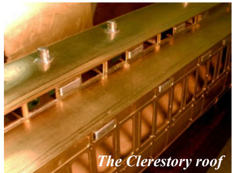
The Clerestory roof