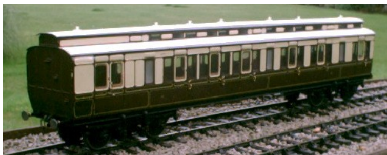
E38 FIRST-THIRD COMPOSITE