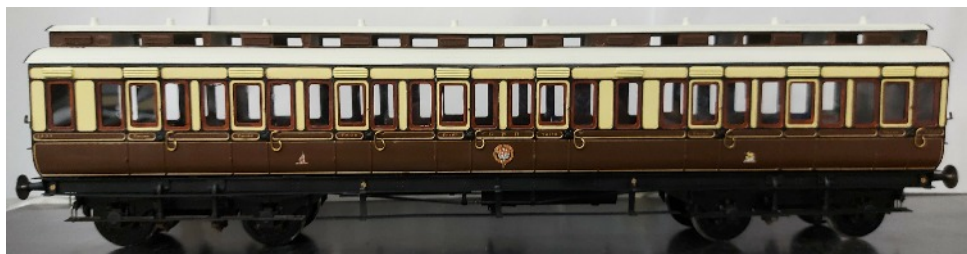
C8 ALL THIRD