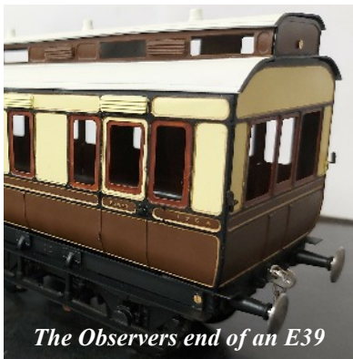
The Observers end of an E39