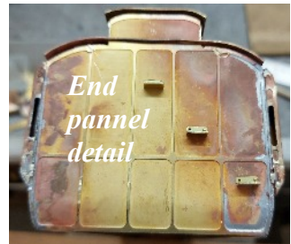
End pannell detail