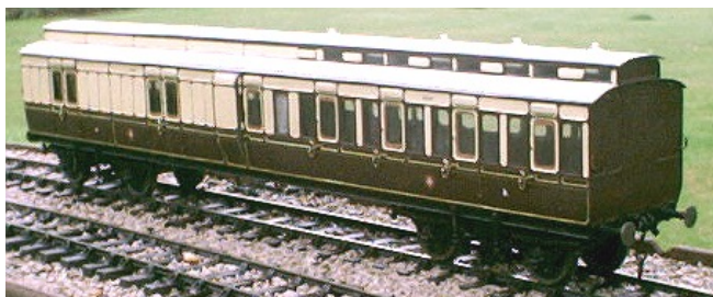
D12 brake second