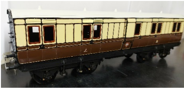
K14 LUGGAGE VAN