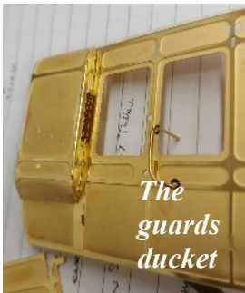
The guards ducket

All kits have bogie, chassis, body and clerestory roof etches, plus lots of detail castings in brass and whitmetal.