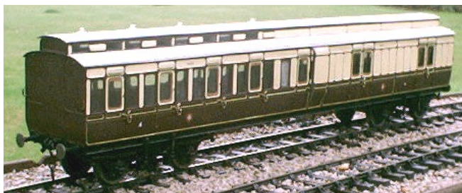
D10 BRAKE THIRD