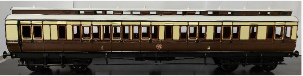
E39 TRI-COMPOSITE "Falmouth Coupe"