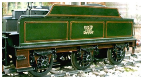
GWR 3000 gallon tender

For overseas customers, the total cost would include the price of the complete kit plus the cost of delivery to your country per instalment. Please enquire for more details.